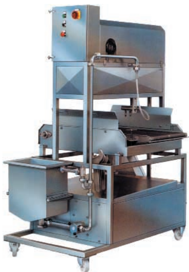
IN-LINE GLAZING UNIT