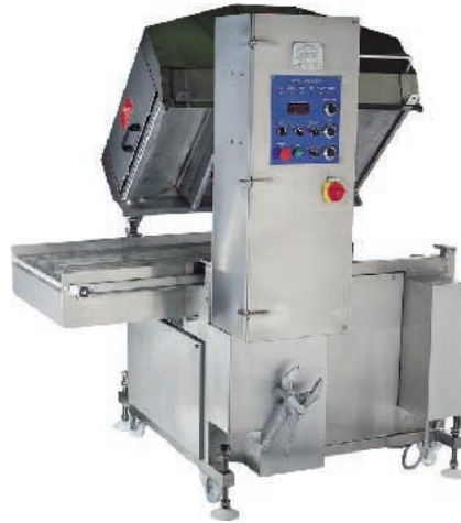
EGG GLAZING UNIT