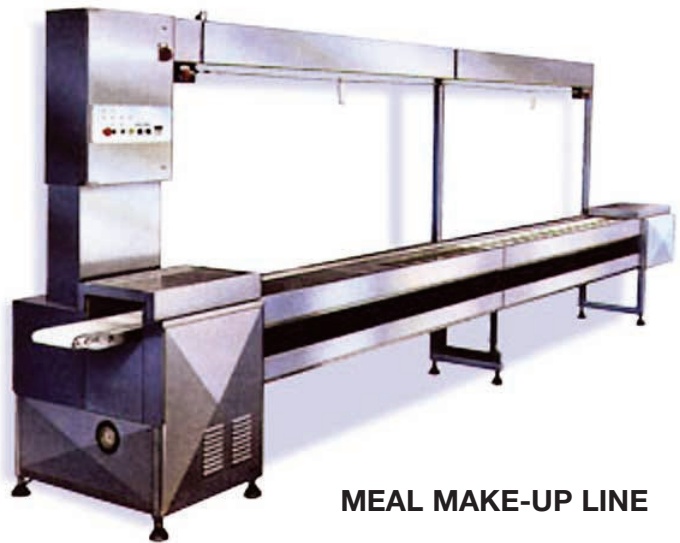
MEAL MAKE-UP LINE