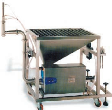
LOW LEVEL DEPOSITOR