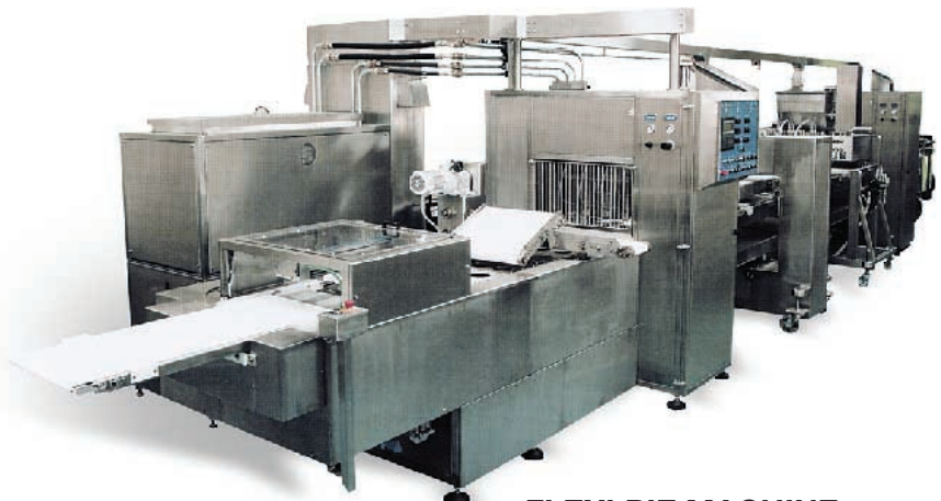
FLEXI PIE MACHINE