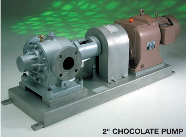
2" CHOCOLATE PUMP

For the Chocolate and Confectionery Industries.