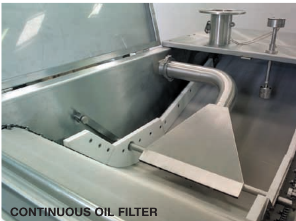
CONTINUOUS OIL FILTER