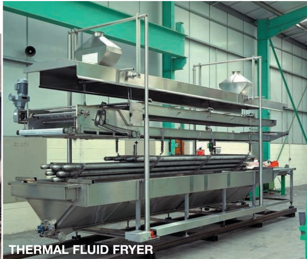
THERMAL FLUID FRYER