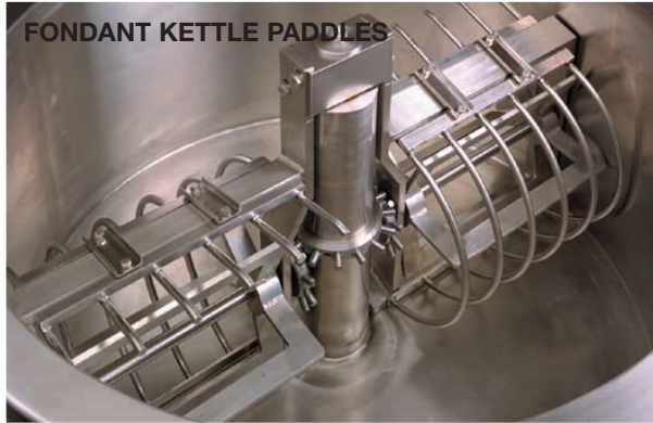
FONDANT KETTLE PADDLES